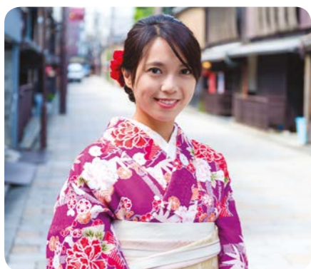
a. She is from Japan.