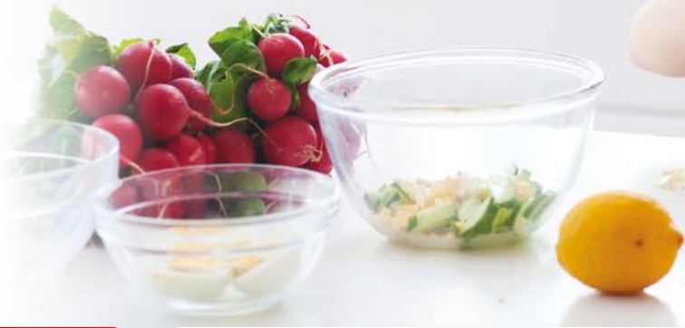
When you cook, you need a knife to cut up vegetables and meat.

What are some of the tools we use very often?