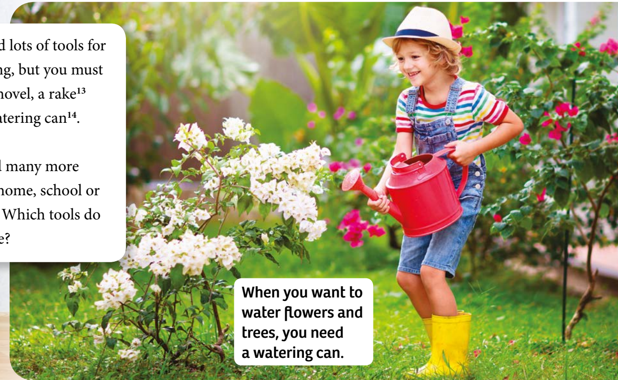
When you want to water flowers and trees, you need a watering can.

We need many more tools at home, school or at work. Which tools do YOU use?