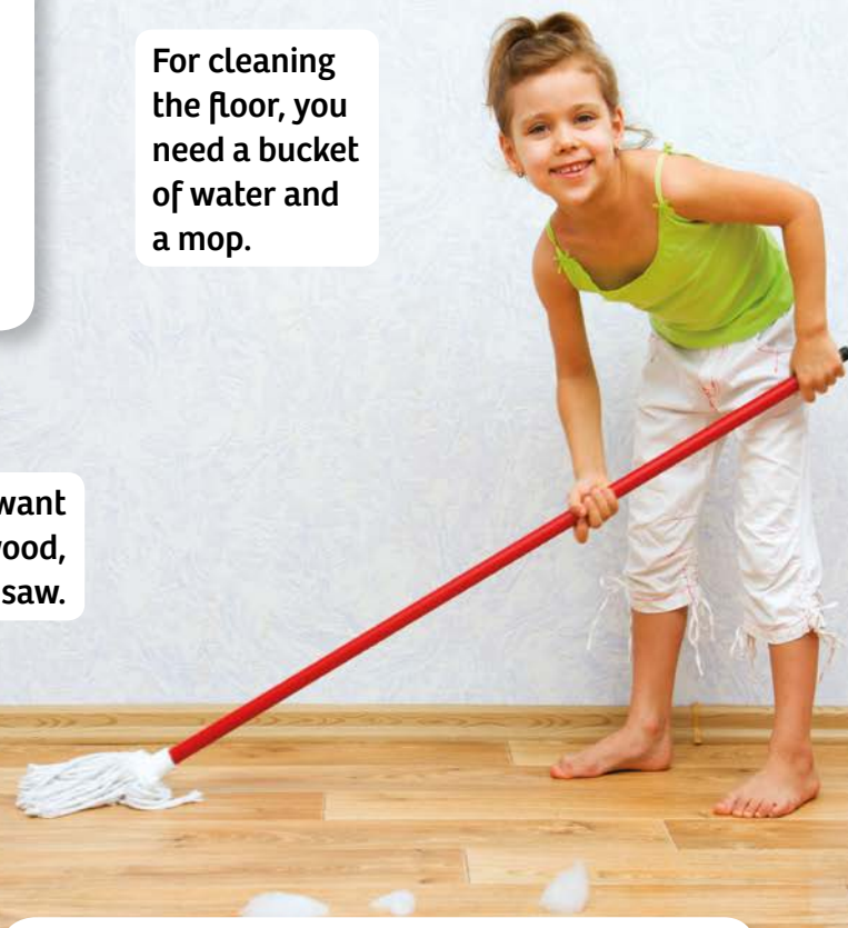
When you want to repair something in the house, the garden or the garage, it's good to have screwdrivers 9 , spanners 10 , pliers 11 and a saw 12 .

For cleaning the floor, you need a bucket of water and a mop.