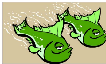
More Than One Animal