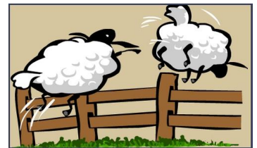
More Than One Animal